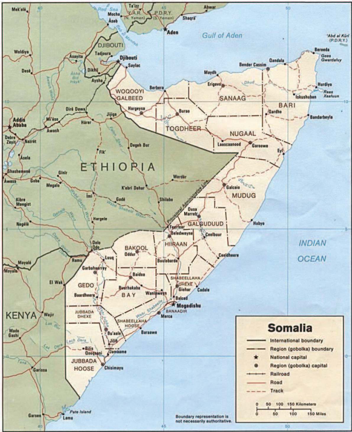
Map 4: The Somali-Ethiopian border