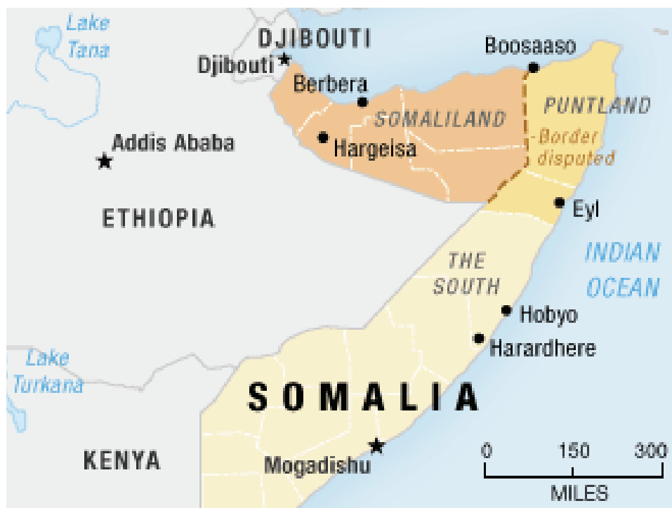
Map 2: Map of Somaliland and Puntland