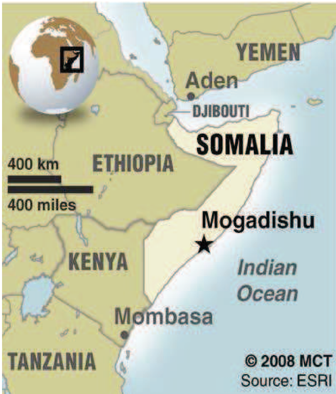
Map 1: Somalia and its neighbors