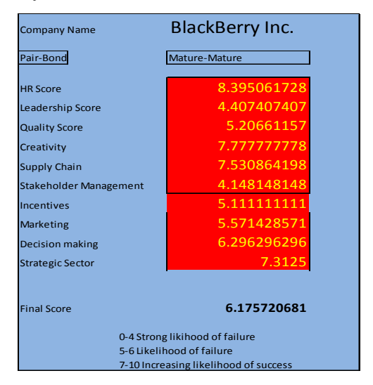
Figure 4. Summary Page from Tool (Author's Construction)

qualitative perspective, and based on the research conducted by the analyst on the company. Summary sheet from the tool: