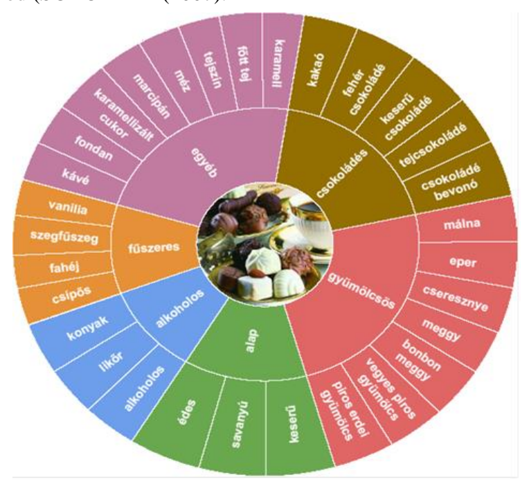
Figure 2: Flavour wheel of pralines

After discussion 7 attributes were deselected because the panellists found them to difficult to understand or to score. The excluded attributes were: melting in the hand, fracturability, adhesiveness, dryness in mouth, residues after chewing, dryness and stickiness of filling.