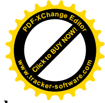
Table 5 – The relationship between the stages of behavior change and exposure to the different promotion tools