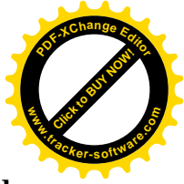
Table 2 – The relationship between the exposure to promotion tools and demographic characteristics